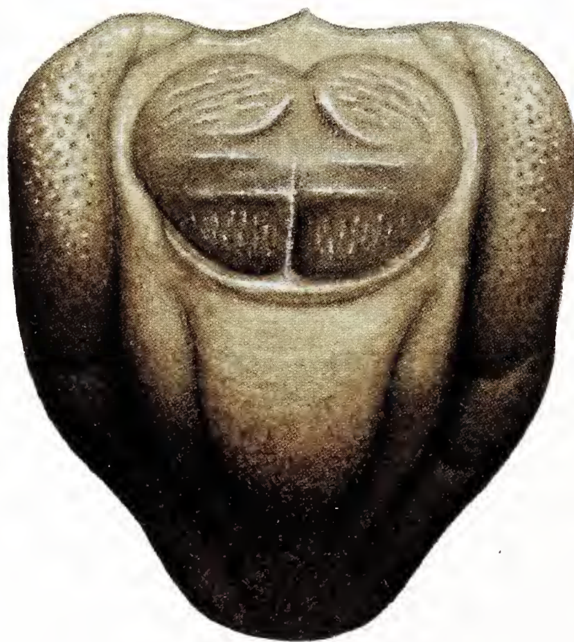
Fig. 2 – Striadiogenes frigerioi n. gen., n. sp., reconstruction of cephalic shield / ricostruzione dello scudo cefalico.

Diagnosis: shield longer than broad; postantennal projections poorly developed; anterior region narrow and slightly raised centrally; subelliptic raised and calcified central part of shield marked by transverse and oblique striae medially and proximally, and divided by a short medial gastric groove proximally; proximal and medial sections of central part of shield flat, distal part inclined backwards marked by irregular roughness and divided by a thin medial ridge; pointed rostrum weakly developed; anterior margin weakly concave; anterolateral regions strongly raised and marked by a weak roughness mixed with small pits; posterolateral and posterior regions flat and well-marked by grooves; cervical groove and linea transversalis present and subparallel; ocular peduncles slightly longer than half length of shield; chelipeds equal and strong; chelipeds with chela longer than broad; fingers moderately curved ventromesially; merus and carpus of cheliped with corrugated striae partially superimposed and arranged vertically on outer face; palm of cheliped with small and flat tubercles on outer face; ambulatory legs strong and flat with corrugated dorsal and ventral margins; dactyli of ambulatory legs broadly curved, approximately as long as propodi; P4 semichelate; P4-P5 considerably smaller than P2-P3.